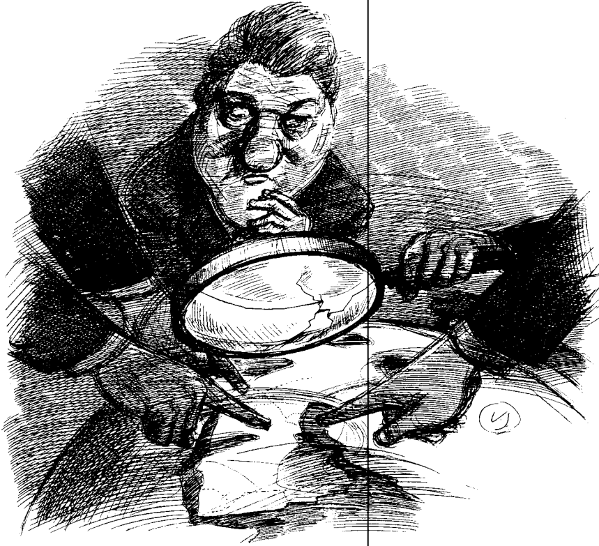
The President tended toward caution while some of his aides advocated force, but he issued the bombing order one day after receiving the F.B.I. report.

The Post article named Berger and two other high-level Clinton Administration officials—R. James Woolsey, the director of the Central Intelligence Agency, and Frank G. Wisner, now an Under-Secretary of Defense—as being among those who advocated "direct retribution" against Iraq. By this time, too, Martin Indyk was hard at work, telling selected journalists, "We've got it"—that is, highly reliable intelligence tying Iraq to a plot against Bush. Indyk also said that Saudi Arabia, which had been the most important American and Kuwaiti ally in the Gulf War, was pressuring the